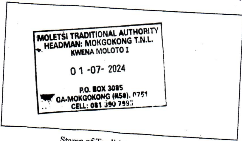
Stamp of Traditional Authority